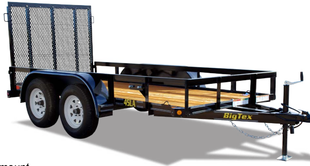
Shown with optional rampgate and spare tire mount